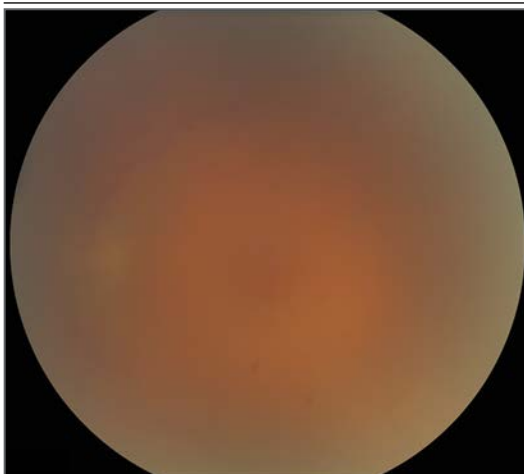
Figure 3. Fundus Photograph of the Left Eye 14 Weeks after the Onset of Ebola Virus Disease.

In conclusion, our patient's recovery from EVD was complicated by acute anterior uveitis, which rapidly evolved into a sight-threatening panuveitis with detection of persistent EBOV within the eye. This case highlights an important complication of EVD with major implications for both individual and public health that are immediately relevant to the ongoing West African outbreak. It is reassuring that samples of conjunctivae and tears tested negative for EBOV, a finding that supports previous studies suggesting that patients who recover from EVD pose no risk of spreading the infection through casual