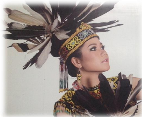
Author's photos taken in Balikpapan, December, 2014.