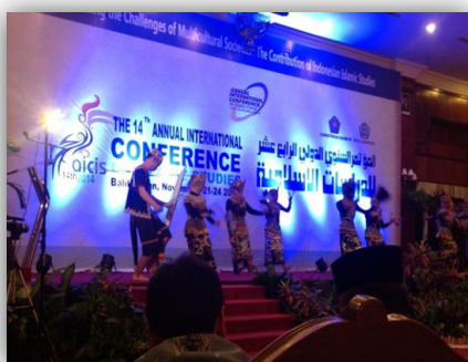
Authors photos taken in Balikpapan, December, 2014.