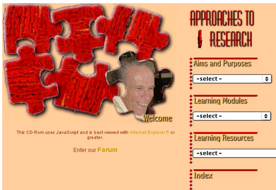
Figure 1. Home Page for the topic - Approaches to Research

Because the CD-ROM is hot linked to the School Intranet, and since both CD-ROM and Intranet make use of browser software (Explorer or Navigator), the student, who is at a workstation linked to the Internet and with the course CD-ROM in the drive, can seamlessly navigate between the two sets of materials. Importantly, however, online costs are incurred only when using the bulletin boards or otherwise communicating with the tutor. Figure 1 shows the home screen for the CD-ROM produced for the topic, Approaches to Research. When students click to enter the Forum or view the Topic Schedule under Aims and Purposes (see Figure 2), they need an Internet connection. Otherwise, they are accessing the CD-ROM. Navigation between CD-ROM and Intranet is seamless.