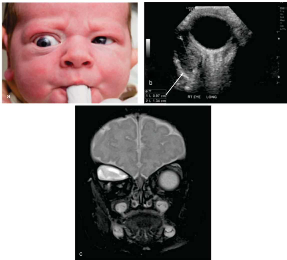
Fig. 1 (a) Proptosis of the right eye with subconjunctival hemorrhage, right-sided hypotropia, and impaired right lateral gaze. (b) Orbital ultrasound (right eye); calipers and arrow indicate retroorbital hematoma. (c) Orbital magnetic resonance imaging (MRI) T2 coronal image showing mixed-intensity, predominantly hyperintense mass.

was no obvious breach involving the bony roof of the orbit to suggest the possibility of a meningocele or a meningoencephalocele. The infant was followed up closely and lubricating eye drops were applied to avoid exposure keratopathy. The proptosis resolved clinically over the course of 10 weeks. The infant had normal visual outcome at the last assessment at 12 months of age.