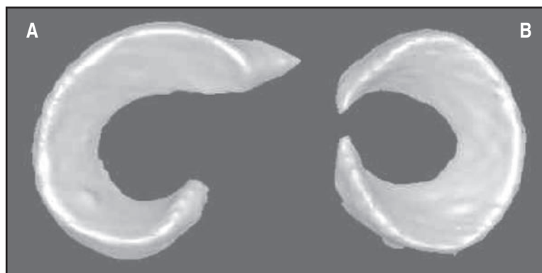
Figure 2: Three-dimensional reconstructed computer display of the two acrylic meniscal phantoms showing (A) medial and (B) lateral cartilages.

puter workstation (Silicon Graphics; Mountain View, CA, USA), for three-dimensional image generation and volumetric analysis using the Velocity 2 Pro reconstructive software package (Image3, LLC, Utah, USA).