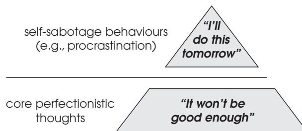
Figure 2: An example of visible behaviours and their underlying cognitions

exam revision off, thinking, “I’m a bit tired; tomorrow will be a better time to do this”. Underlying these behaviours (out of “view”) lie a set of faulty cognitions, which are the true cause of her procrastinating. In our student’s case, these might be perfectionistic thoughts. She might actually believe that what she does won’t be good enough. Because of this belief, she may be reluctant to start something that would not meet her own high standards, and hence this would result in her procrastinating.