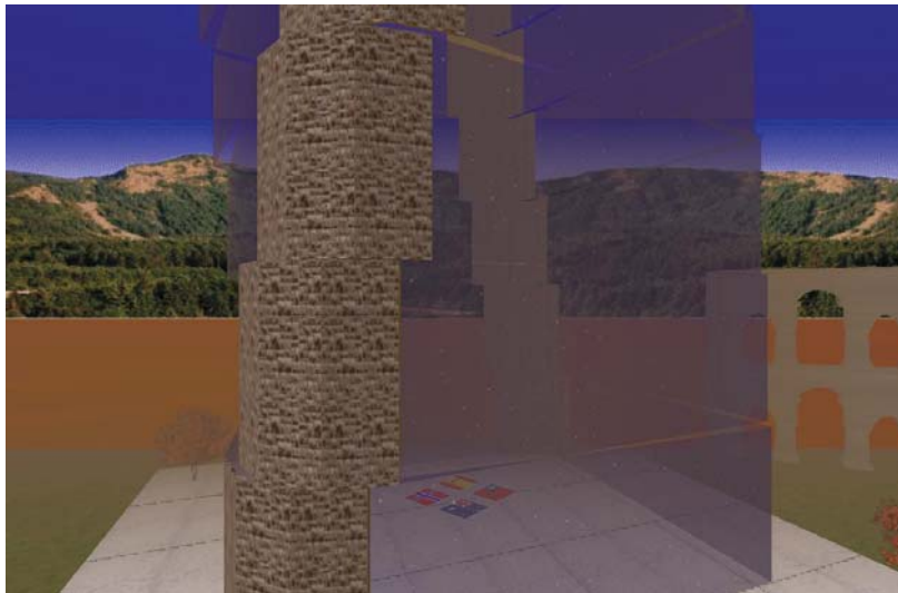
Fig. 4. A Babel tower in modern design with national flags on the floor

Students adopted various construction solutions for their towers, incorporating different aspects of their intercultural collaborative processes and communication. Most of the towers followed a ‘modern’ design approach (Fig. 4) while there were also examples of towers in a more ‘authentic’ style (Fig. 5). Nearly all towers were built vertically, to reflect the “reaching heaven” idea of the parable, sometimes representing the idea of the tower symbolically, such as with a set of ‘endless’ stairs. Some of the towers reflected the cross-cultural aspects of the exercise. For example, in one case a greeting from the Australian team “G’day from Australia” was displayed together with a Norwegian sign on the top saying: “We cannot continue as we speak different languages”. In two additional cases, the cross-cultural collaboration was symbolized with national flags on the constructions: Australian, Taiwanese, Norwegian and Spanish, the latter from an exchange student in the Norwegian team (Fig. 4). At the end of the final performance, students examined peer towers, discussing the designs and voting for the best one.