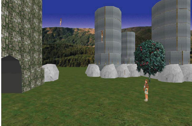
Fig. 3. Building ‘trial’ towers during ‘rehearsal’ sessions

Collaboration was also complicated by ‘acts of vandalism’. Prior to the day of the final performance, an anonymous user with the nickname “admin”, deleted the building stones on some of the construction sites. This behaviour led to frustration among the builders (as the deleted items had to be replaced) and impacted negatively on the overall collaborative atmosphere. In the recorded chats, there were suggestions that this was done by one of the groups in order to complicate the work for their competitors.