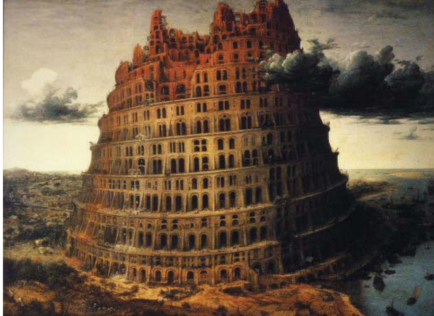
Fig. 1. A number of towers of Babel have been envisioned over the years. This is a 16 th -century version by Brueghel (1563) based on the Colosseum in Rome.

combination with a 3D CVE, featuring synchronous and asynchronous information exchange. It is part of a system developed over a number of years of previous use of remote collaboration 3D CVEs by the authors [7]. The 3D CVE in this context was chosen because it capitalizes on a pre-existing common interest by students in the international multi-user 3D computer game culture, and the ability of a 3D CVE for supporting informal socialization [8, 9]. The collaborative learning in the multicultural team environments described here followed a process of acculturation to a new knowledge community [10, 11].